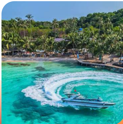
Phu Quoc Speedboat