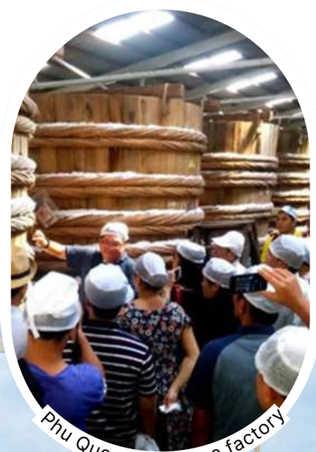
Phu Quoc fish sauce factory