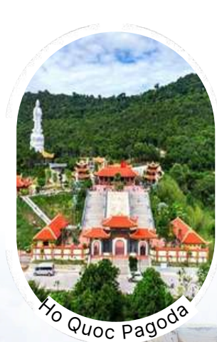
Ho Quoc Pagoda