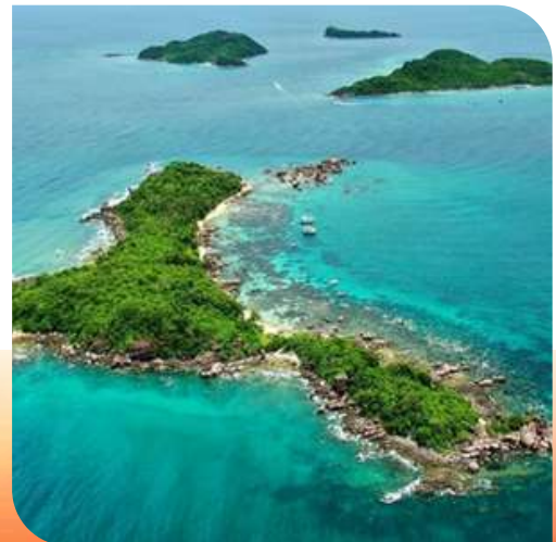
Gham Ghi Isle